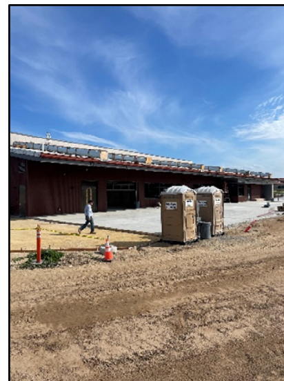
Standing Seam Roofing