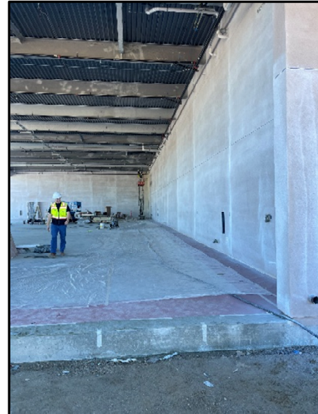
Open Area Paint