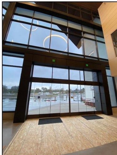
Cleaning In Progress