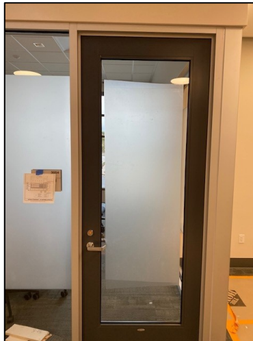
3M Glazing Film – Mockup