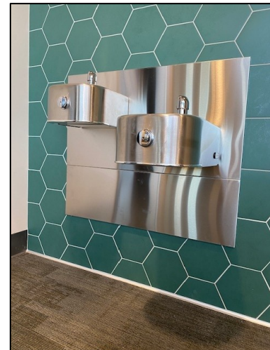
Water Fountain Panel