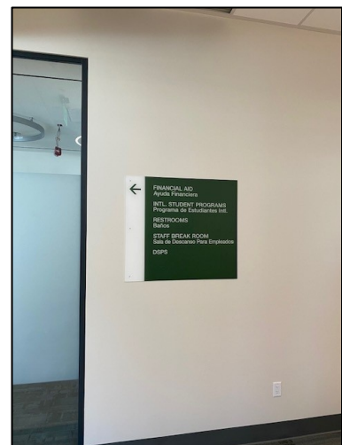
Interior Directional Signage