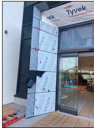
Alpolic ACM Panels