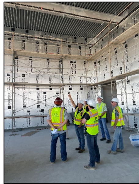
OAC Site Walk