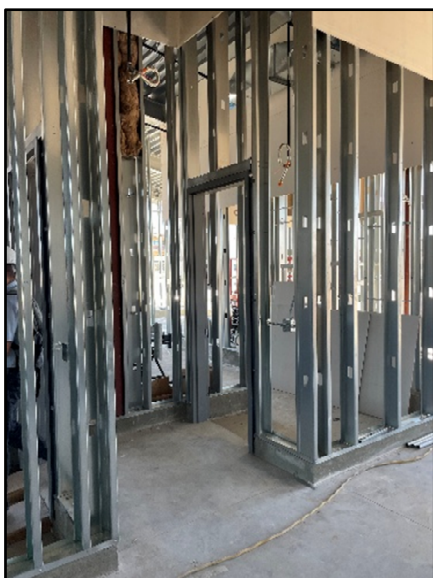
Hollow Metal Door Frame