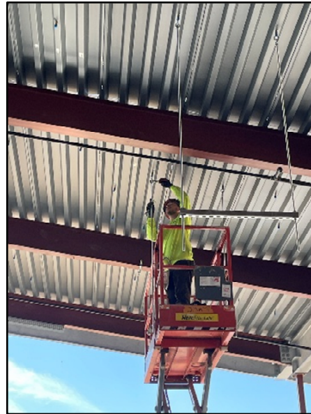
Duct Hangers Install