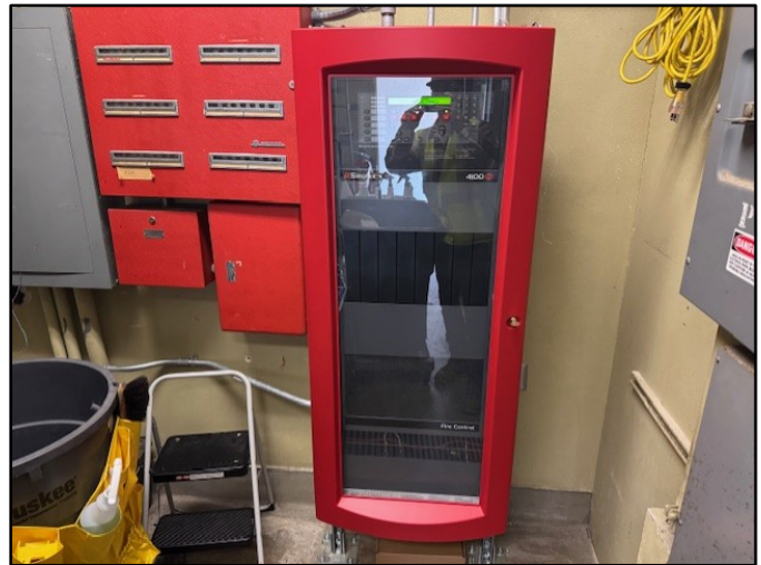
Fire Alarm Panel