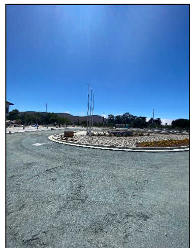
Base at Traffic Loop