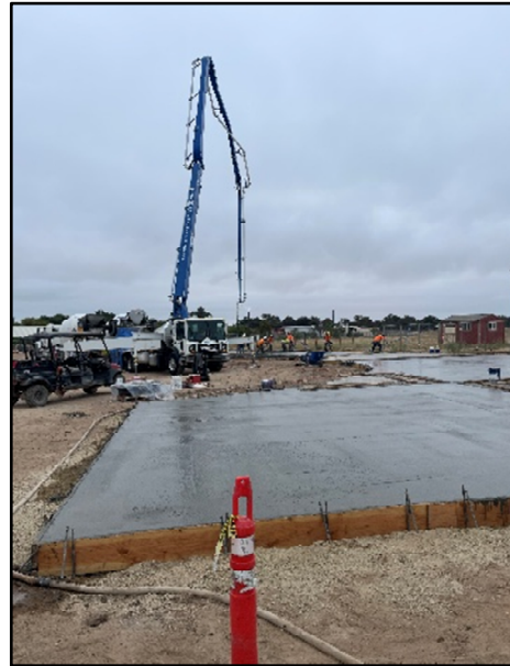
Fire Access Lane

Noise: Loud noise from trade activities Parking: None Utilities: None Odors: None