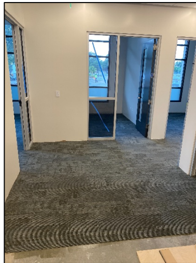
Carpet – 1 st Floor