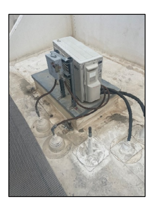
N2400 Server Room Split