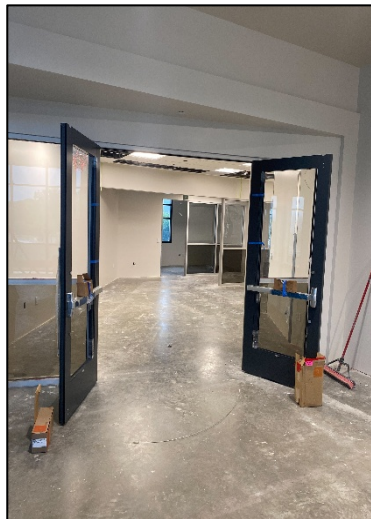
Doors and Hardware