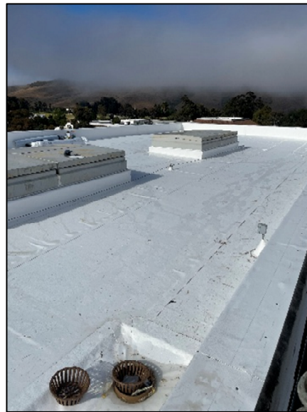
PVC Roofing Material