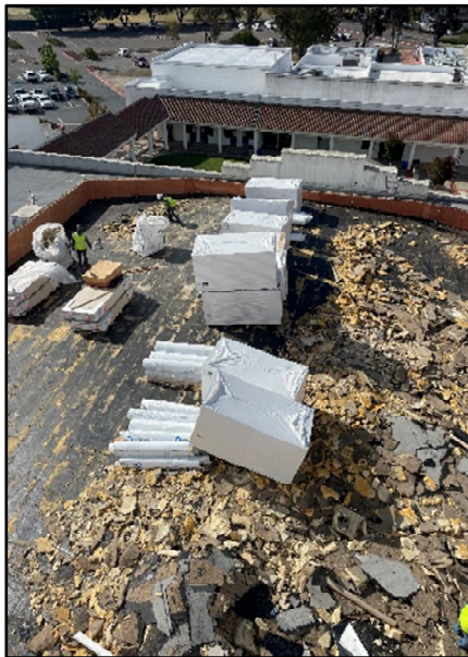
Theater Roof Demolition