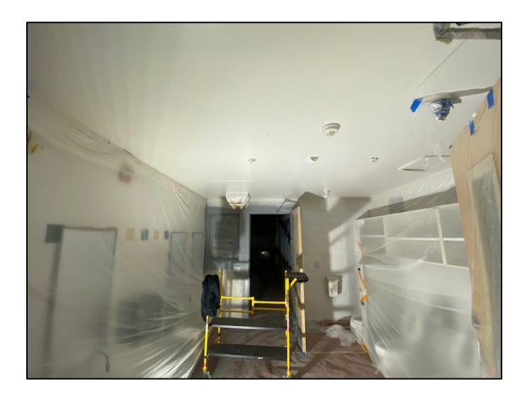
Painting - Building 4000