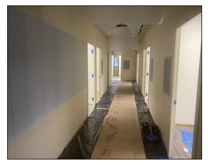
Drywall Patching - Building 6200