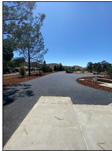
Asphalt Concrete Paving

Noise: Loud noise from equipment & trucking Parking: None Utilities: No Interruptions Odors: None