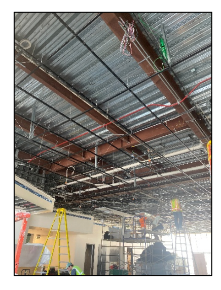
Ceiling Grid System