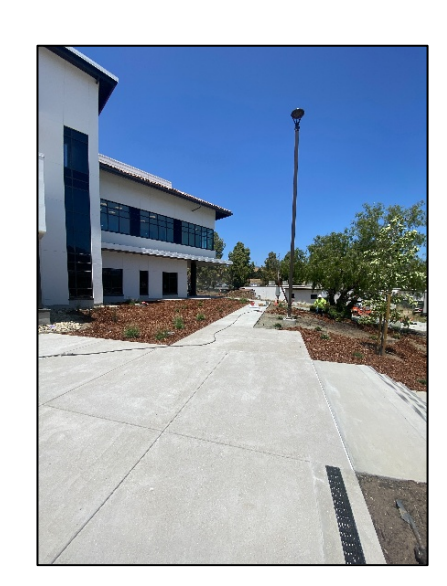
Landscape & Hardscapes