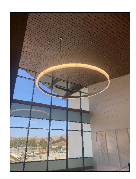
Pendant Light Fixtures