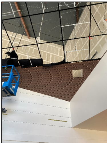
Interior Metal Panels