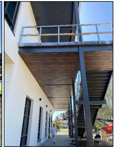
Exterior Metal Panels