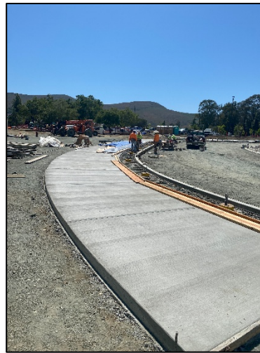
Concrete at Entry

Noise: Loud noise from equipment & trucking Parking: None Utilities: No Interruptions