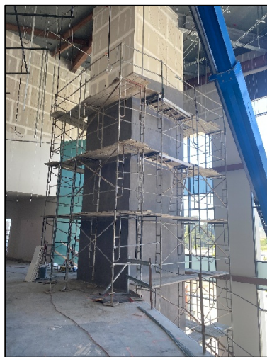
Elevator Exterior Stucco