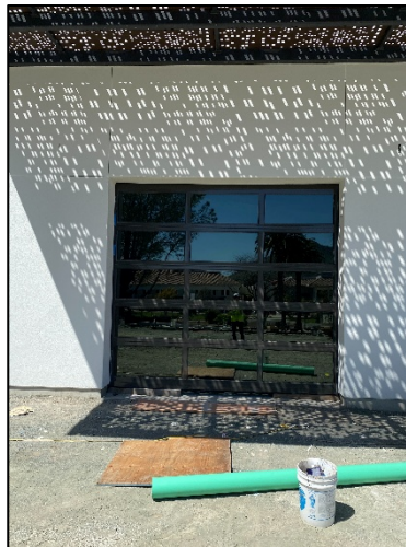
Overhead Door Glazing