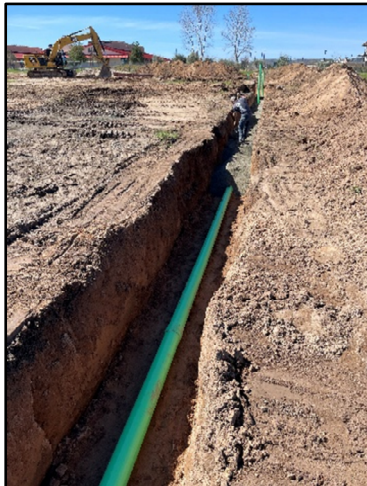
Sewer Line Install