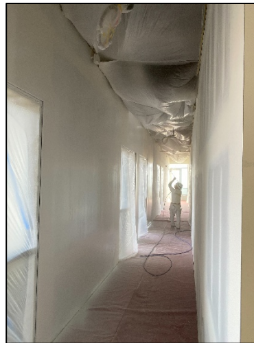
Painting – 1 st Floor

Noise: Loud noise from equipment & trucking Parking: None Utilities: No Interruptions