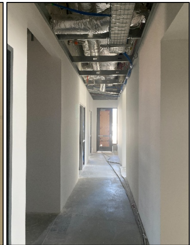
Painting – 1 st Floor