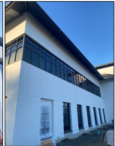
2 nd Floor Storefront