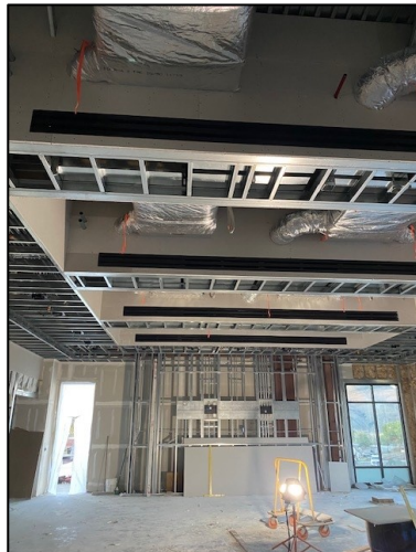
Framing & Drywall