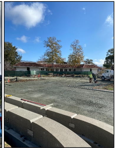
Base at Amphitheater