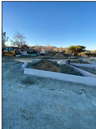
Concrete Curbs – Lot 4