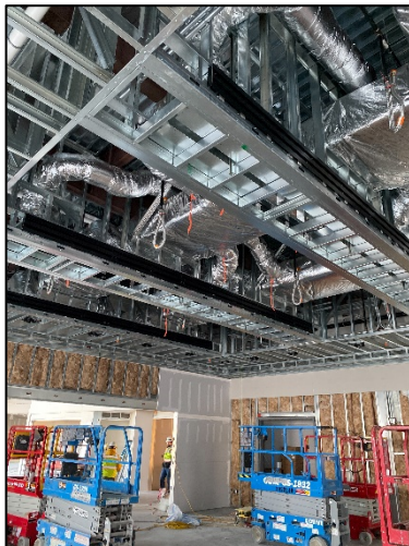
Metal Stud Framing