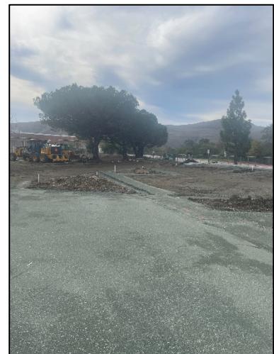
Parking Lot 4