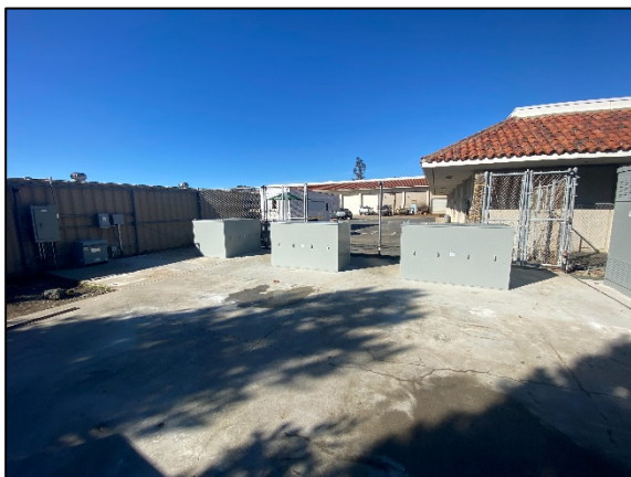
Electrical Gear Enclosures