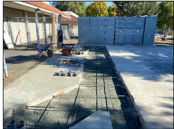
Base and Rebar for Concrete Flatwork