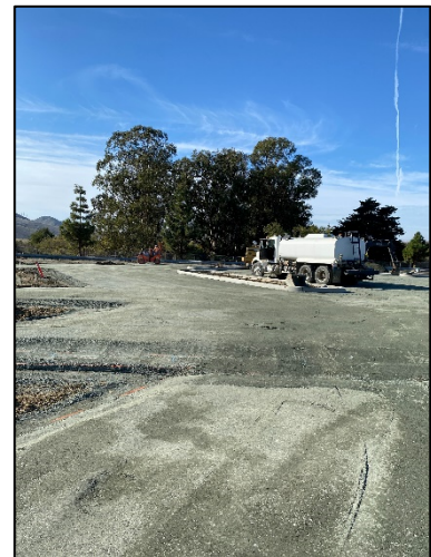
Base Parking Lot 4