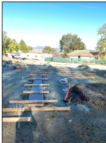
Concrete Bench Footings