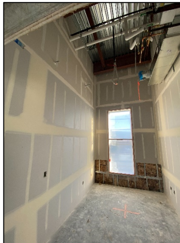
Drywall Taping – 2 nd Floor