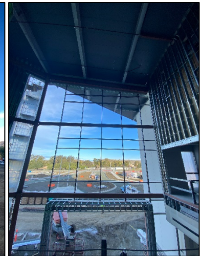
Curtain Wall Installation