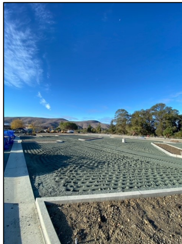
Lot 4 Base