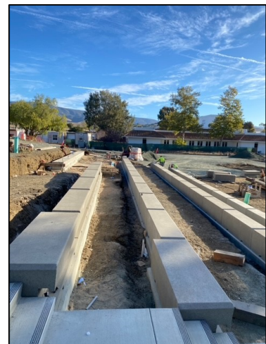
Pre-Cast Bench Installation