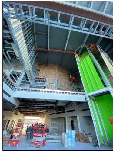
Insulation – 2 nd Floor

Noise: Loud noise from equipment & trucking Parking: None Utilities: No Interruptions Odors: None