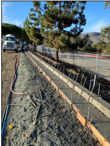
Concrete Curbs – Lot4