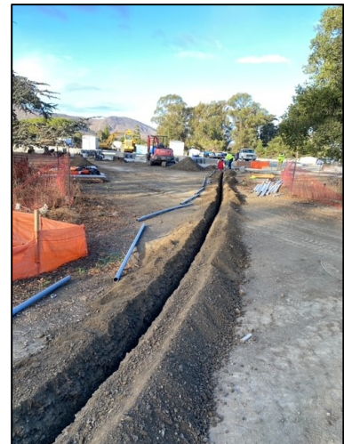
Site Lighting – Lot 4