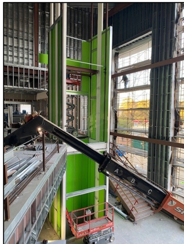
Framing at Elevator Shaft