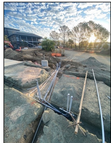
Electrical for Site Lighting