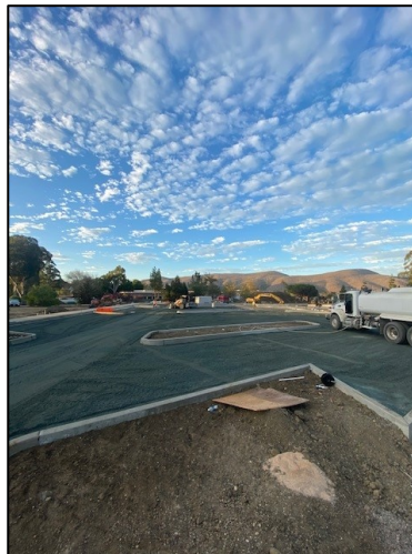
Base at Parking Lot 4