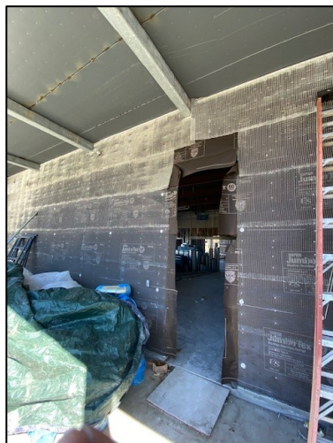
Exterior Lath 2 nd Floor