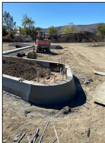
Concrete Curbs Lot 4