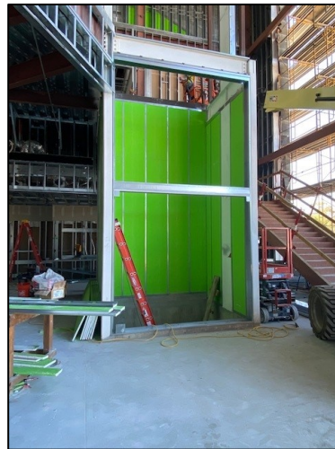
Elevator Shaft Walls

Noise: Loud noise from equipment & trucking Parking: None Utilities: No Interruptions Odors: None