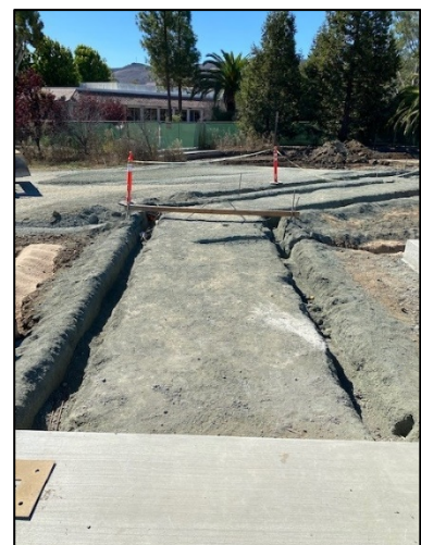
Grading for Flatwork