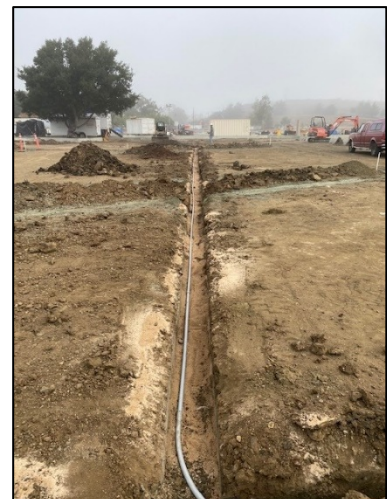
Site Lighting Rough In Lot 4