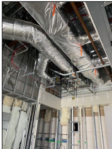
HVAC Duct Insulation