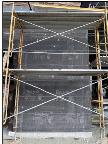
Exterior Lath Installation