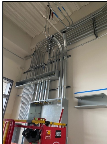
Electrical Rough In 1 st Floor

Noise: Loud noise from equipment & trucking Parking: None Utilities: No Interruptions Odors: None