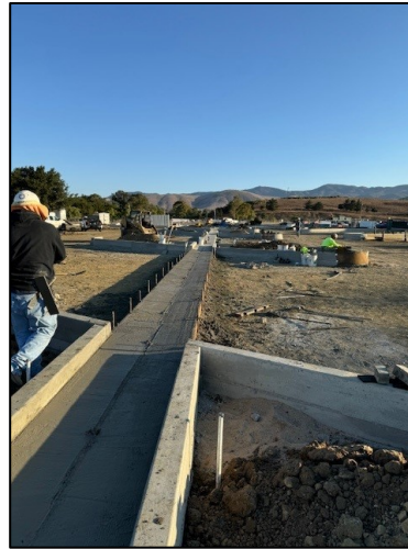
V-Gutters – Lot 4

Noise: Loud noise from equipment & trucking Parking: None Utilities: No Interruptions Odors: None