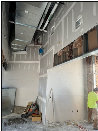
Drywall/Tape – 2 nd Floor