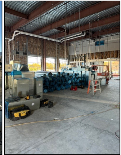
HVAC Duct Materials