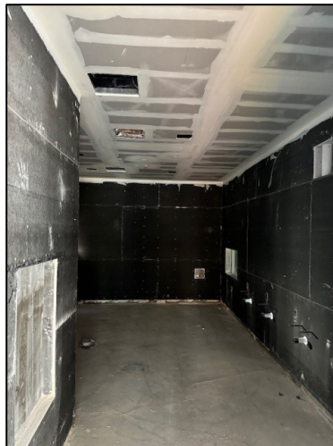
Hard Lids – 1 st Floor Restrooms