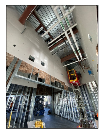
Drywall Installation – 2<sup>nd</sup> Floor