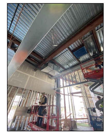
Duct Work Installation – 2<sup>nd</sup> Floor