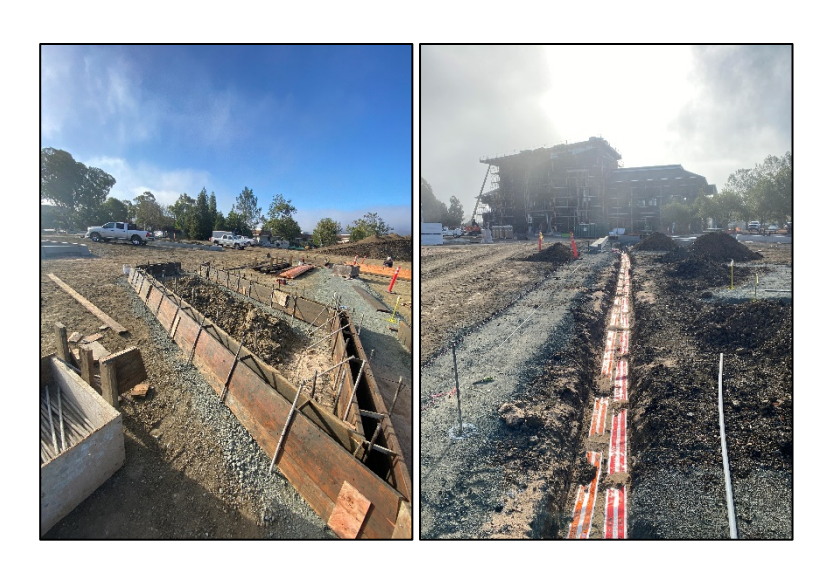
Concrete Formwork – Lot 4 Underground Electrical – Lot 4

Loud noise from equipment & trucking None No Interruptions None