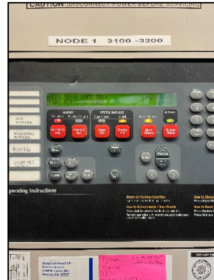
JCI FACP Testing

Noise: Loud noise from trade activities Parking: None Utilities: None Odors: None