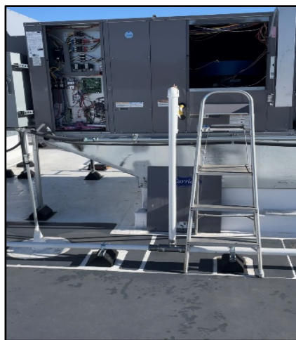
Low Voltage Inspection