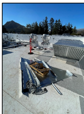
Job Site Clean Up