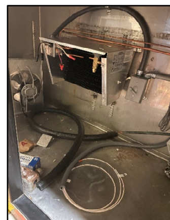
Cooling Table Evaporators