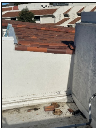
Roofing Details Progress