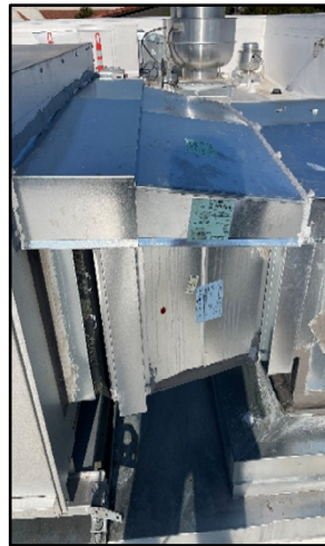
Air Test and Balance

Noise: Loud noise from trade activities Parking: None Utilities: None Odors: None