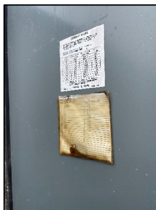
Marking of Equipment