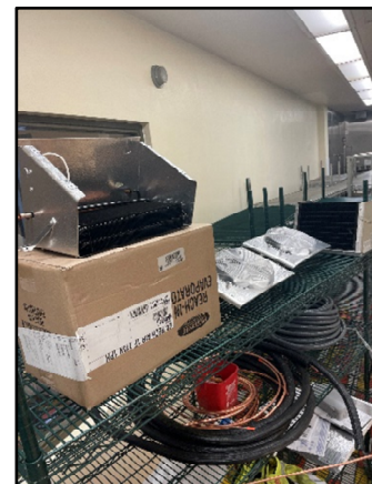
Evaporators Cables Staged