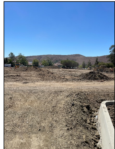
Parking Lot 4 Curbs, Pedestrian Flatwork, Demo, & Earthwork