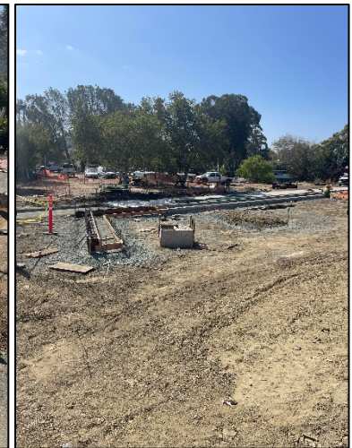
Terraced Seating Stair Footings Parking Lot 4 Curb Forms