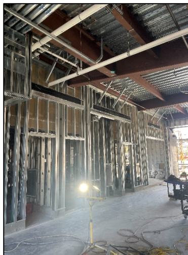
HVAC Linear Diffusers