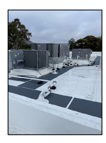
Roof Walking Treads