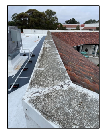
Remaining Parapet Cap