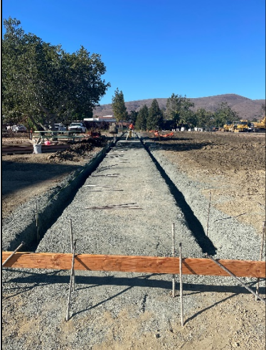
Parking Lot 4 Demo & Pedestrian Flatwork