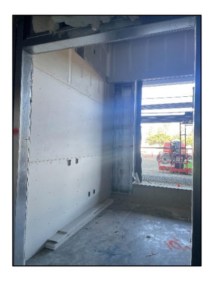
1st Floor Interior Insulation & Drywall