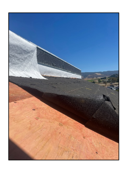
Mansard Roof Parapet Wall Exterior Lath