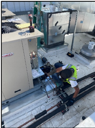
MZU Condenser Start Up