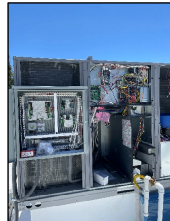
Energy Management Controls