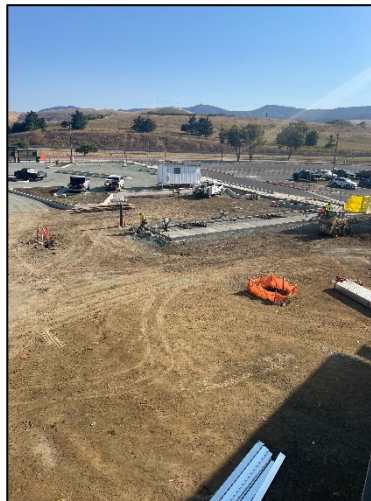
Parking Lot 3 Flatwork