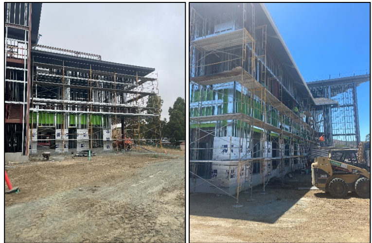
Exterior Scaffolding Erection

Noise: Loud noise from equipment & trucking Parking: None Utilities: No Interruptions Odors: None