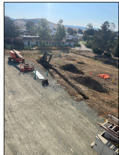
Exterior Hardscape Footings