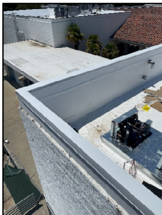
New Parapet Cap