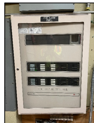
HVAC FACP Integration