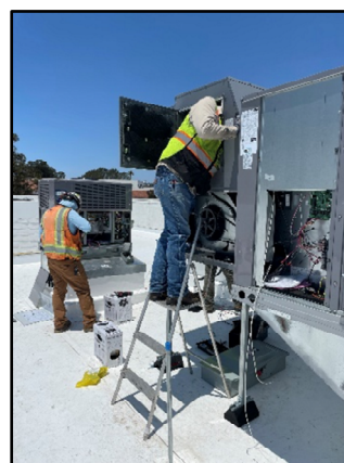
HVAC EMS Controls