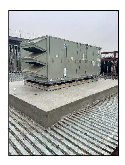
Rooftop HVAC Equipment