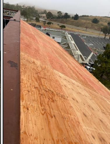
Mansard Roof Underlayment